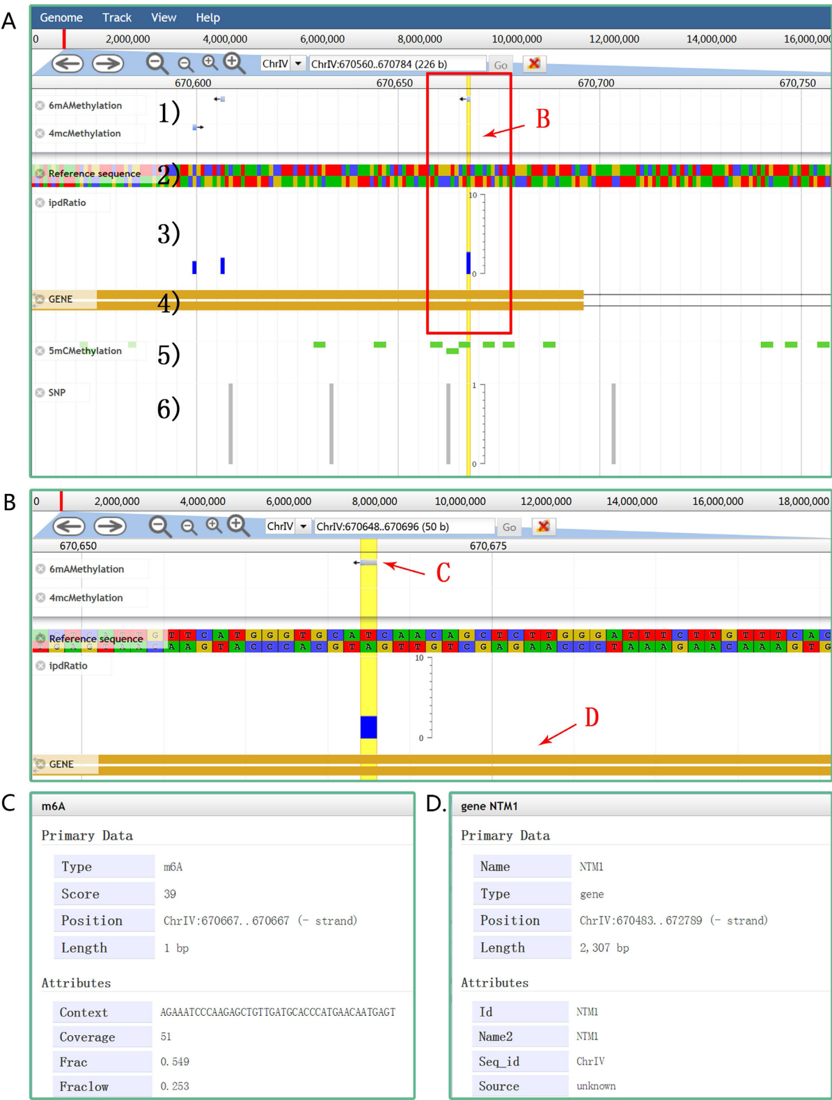
Figure 2. Screenshot of the genome browser. (A) Five information tracks available in the browser: (1) 6mA/4mC track, (2) reference genome track, (3) IPD track, (4) gene annotation track, (5) 5mC track and (6) SNP track. Note that 5mC track is only available for Arabidopsis and mouse. (B) Zoom in a methylation site, with reference genome sequence and IPD signal. (C) Detailed information of the methylation site is available when clicking the methylation site in the browser. (D) Detailed information of the gene annotation is available when clicking the gene annotation track.